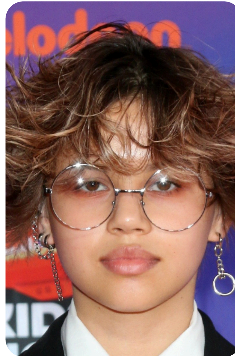
Aria THE BAD GIRL

Phone Home Quiz Fashion Forward with Fifi